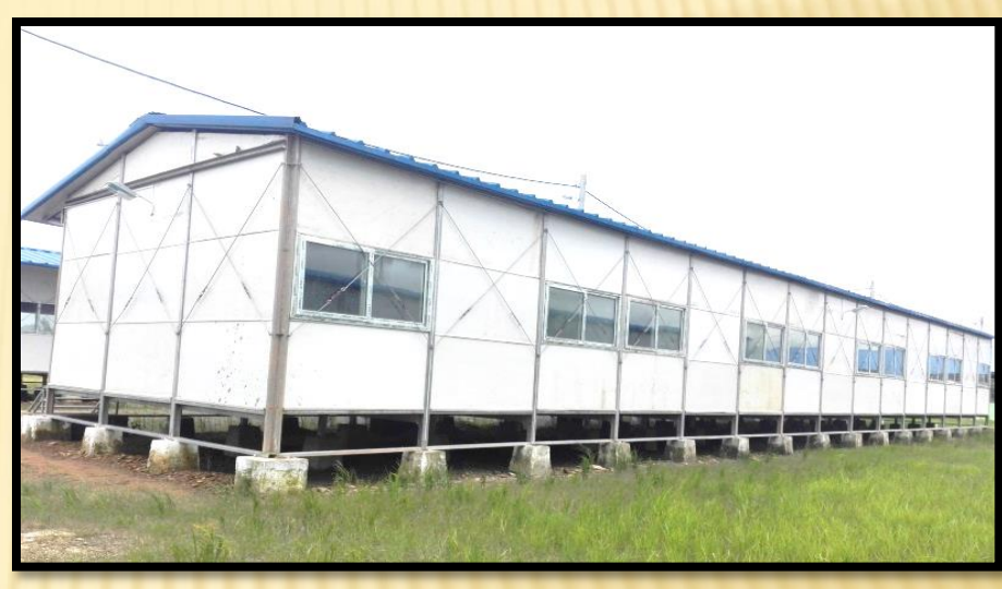
Staff Kitchen House (60'×24') (1)