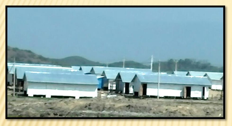
Modular House (90'×18'×12') (6)