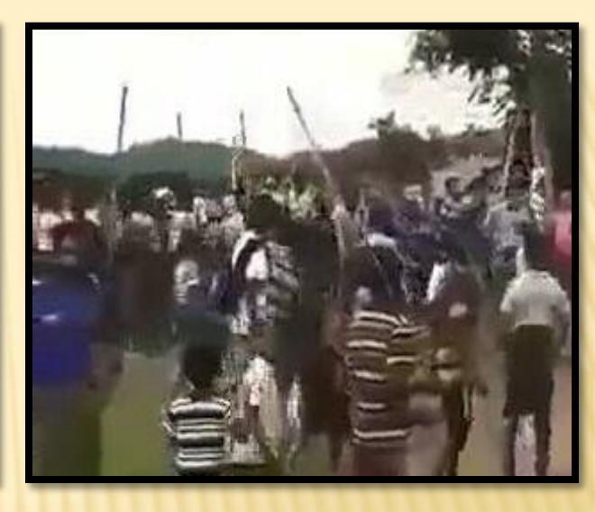
Situations of Terrorist Attacks in Maungdaw region during 2016 and 2017