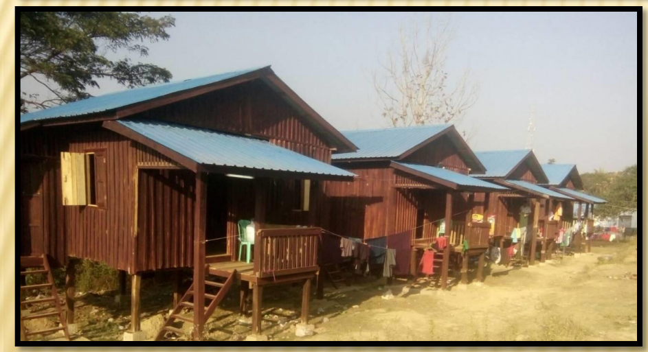
Ramree Township, No.(6) Ward