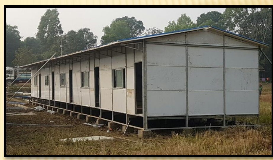
Dinning Room (60'×30'×11') (1)