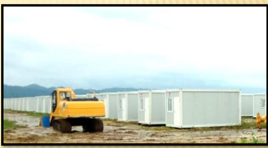
(60'×30') Medical Center