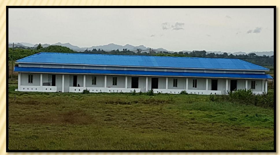
Jail Room (50'×30'×14.9') (1)