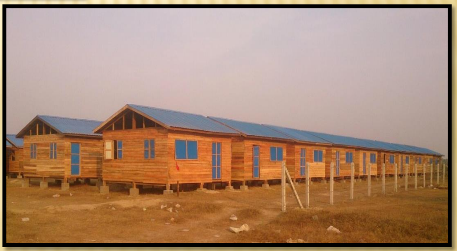
Kyauk Phyu Township, Ka Nyin Taw